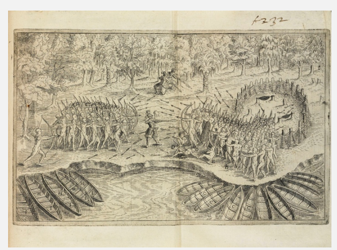
Source Title: "Defeat of the Iroquois at Lake Champlain" published in Champlain, S. de, Les voyages du sieur de Champlain