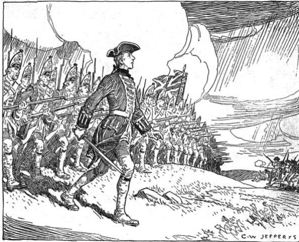
Source: Jefferys, Charles, (1934) "Wolfe at the Battle of the Plains"